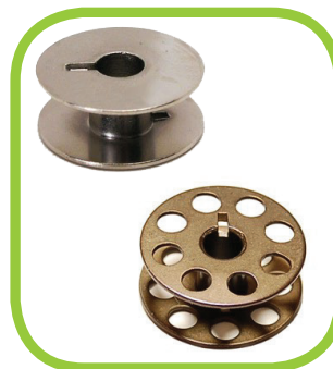
"L or M" bobbin