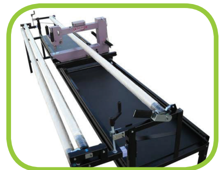
Nolting Commercial Steel Frame