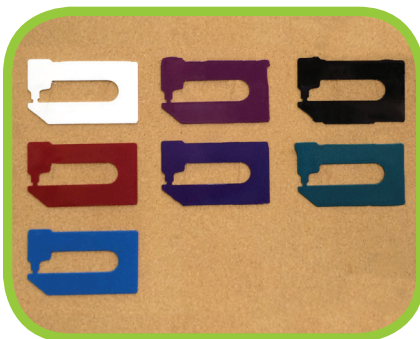
High Gloss Custom Paint Colors

Professional packages include machine, frame, needles, bobbins, bobbin winder, oil, patterns, clamps, leaders, product manuals, and 5-year warranty. Additionally, Nolting offers exceptional services such as delivery, package installations, and superior professional training.